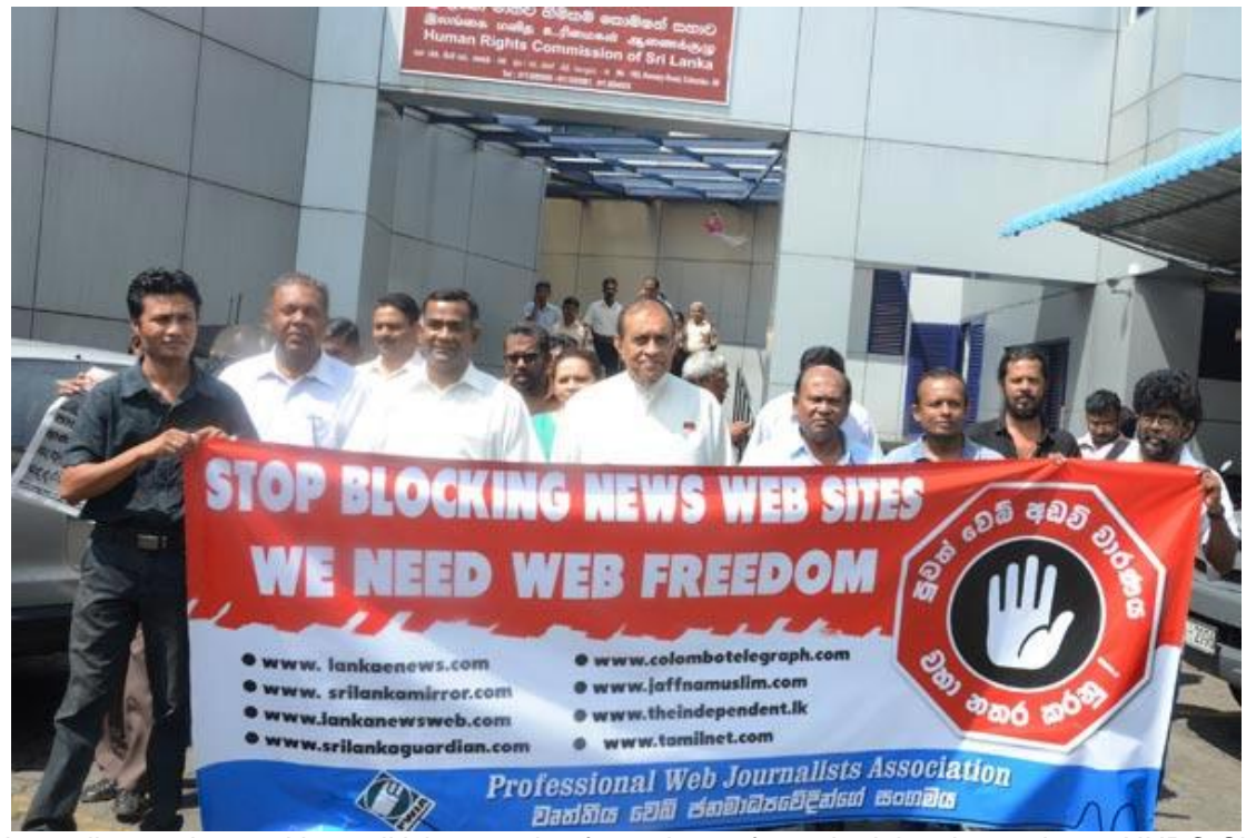
Journalists and opposition politicians posing for a photo after submitting the petting to NHRC-SL

A Commissioner for the HRCSL has told media that the Government blocking websites is unconstitutional<sup>10</sup>. But to the best knowledge of INFORM, until the above complaints had been filed, the HRCSL has not taken any definite and firm action in this regard ever since this practice has started several years ago, despite being vested with powers to initiate investigations on it's own, give formal determinations about the fundamental right(s) being violated, advising the government on unconstitutional requirements to registers websites etc.