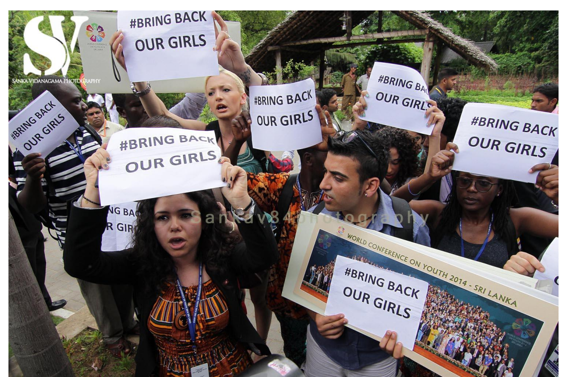
International delegates protest at the World Conference on Youth 2014 in Colombo, against the refusal to hold a press conference. 9<sup>th</sup> May 2014

Sri Lankan Minister of Youth Affairs was reported to have banned a press conference by delegates to the World Conference on Youth (WCY) on the abduction of nearly 300 school girls by Boko Haram militants in Nigeria. WCY was held in Colombo, Sri Lanka from 6<sup>th</sup> to 10<sup>th</sup> May 2014<sup>14</sup>. "These people have a different agenda in mind, and this has nothing to do with the Conference. So I don't think we should allow them to hold a press conference," the Minister is reported to have told the media. The youth delegates told that "This is our event; the world must know of our plight and we, the youth wish to propagate this grave injustice to the world". A group of delegates held a protest against the Minister's actions by holding placards that read 'Bring back our girls'