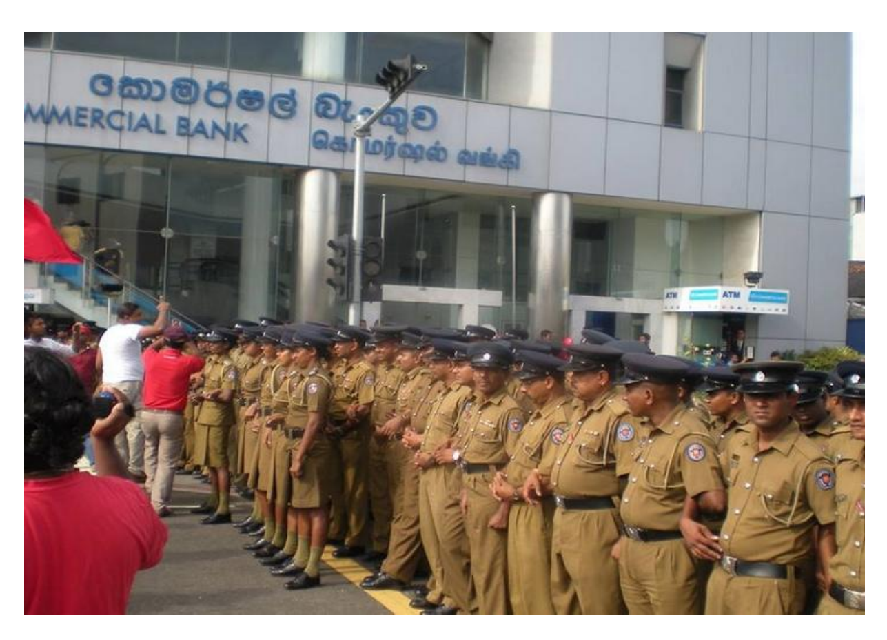
Police blocked the May Day demonstration of the Joint Trade Union Alliance at Slave Island junction