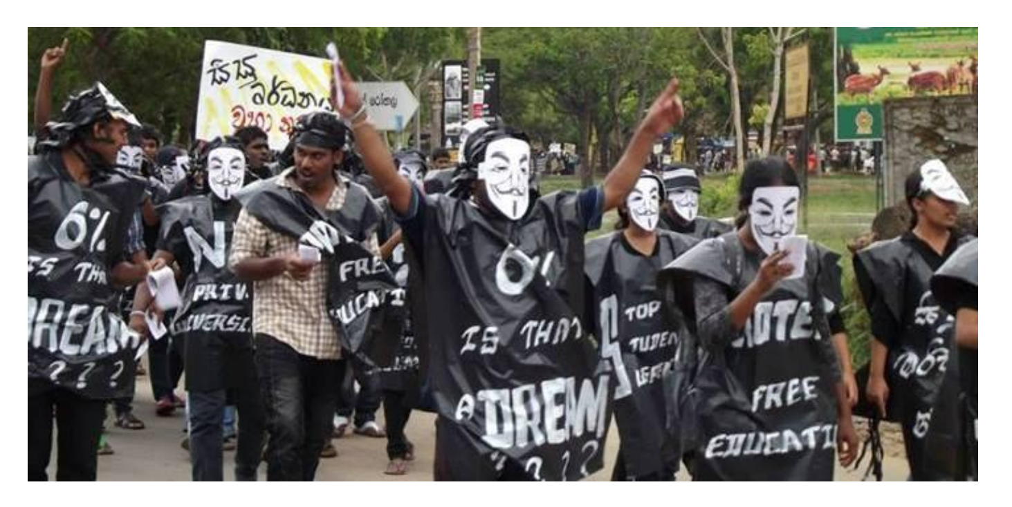
Inter University Students Union (IUSF) protests in Colombo. 17 peaceful student protesters were detained and several were tortured by the Police on 16<sup>th</sup> May.