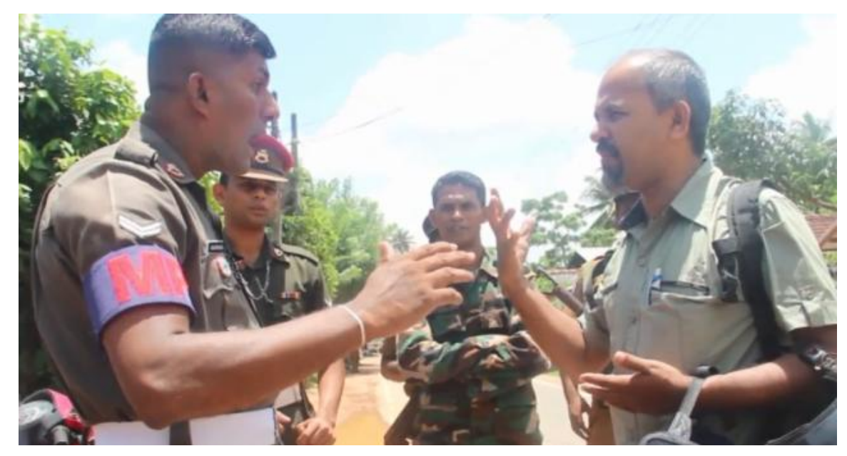
"This is a military area ruled by the military; No entry for journalists without prior permission" officer tells the journalist