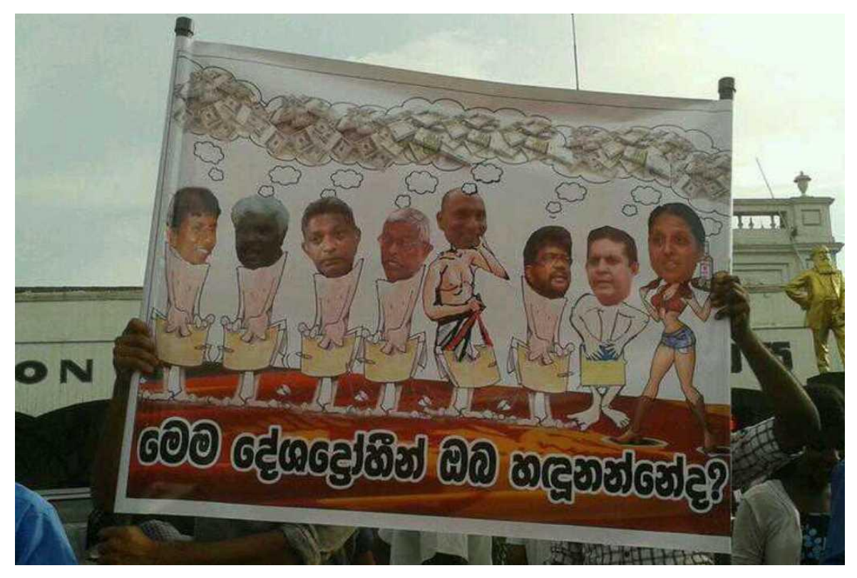
The banner: Do you recognise these traitors?