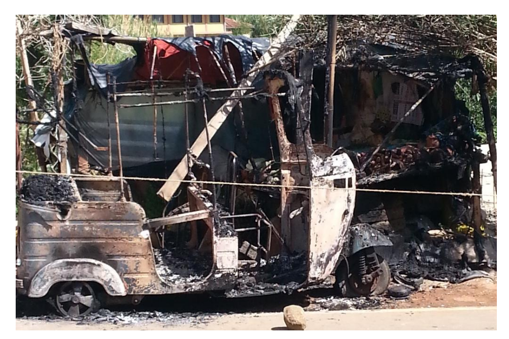
Around 50 election offices of the opposition parties were attacked during the Uva Provincial Council election [A burned three wheeler Taxi belongs to a UNP election office]