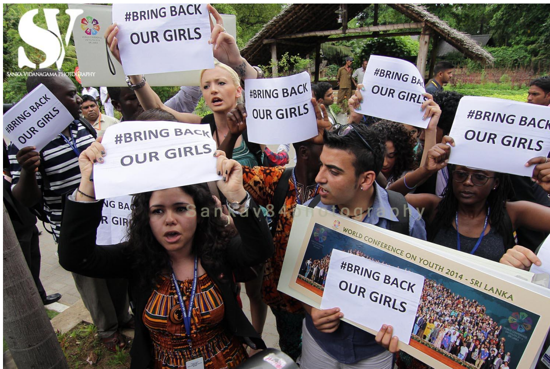
International delegates protest at the World Conference on Youth 2014 in Colombo, against the refusal to hold a press conference. 9 th May 2014

Sri Lankan Minister of Youth Affairs was reported to have banned a press conference by delegates to the World Conference on Youth (WCY) on the abduction of nearly 300 school girls by Boko Haram militants in Nigeria. WCY was held in Colombo, Sri Lanka from 6 th to 10 th May 2014 14 . "These people have a different agenda in mind, and this has nothing to do with the Conference. So I don't think we should allow them to hold a press conference," the Minister is reported to have told the media. The youth delegates told that "This is our event; the world must know of our plight and we, the youth wish to propagate this grave injustice to the world". A group of delegates held a protest against the Minister's actions by holding placards that read 'Bring back our girls'