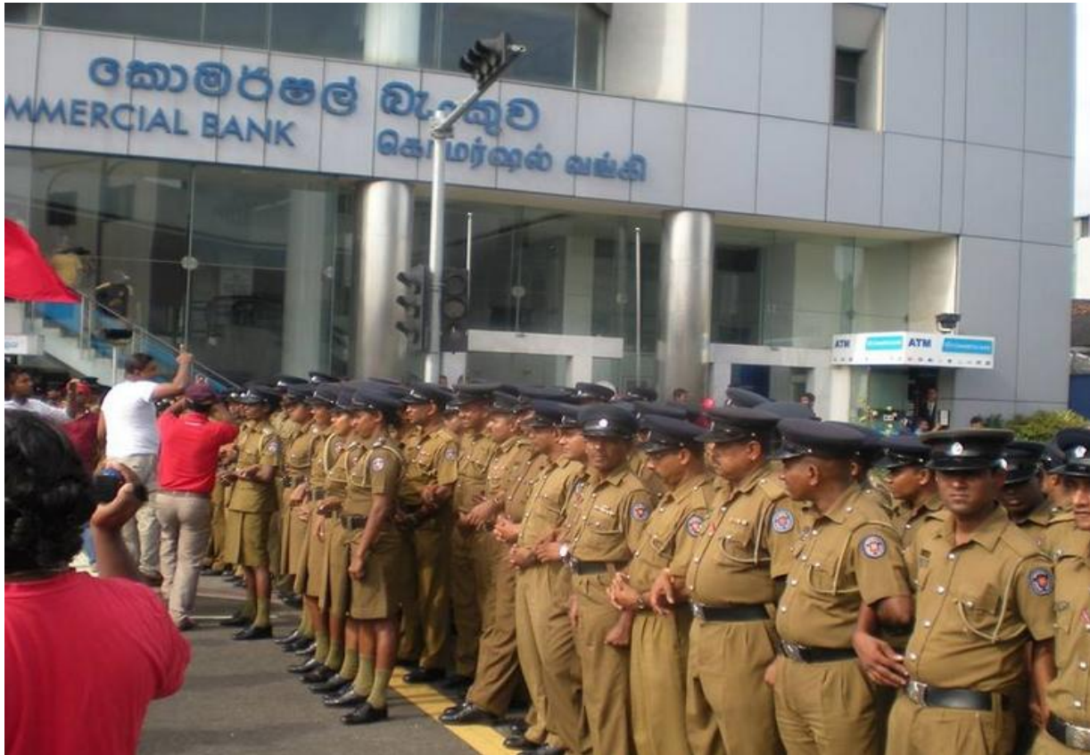
Police blocked the May Day demonstration of the Joint Trade Union Alliance at Slave Island junction