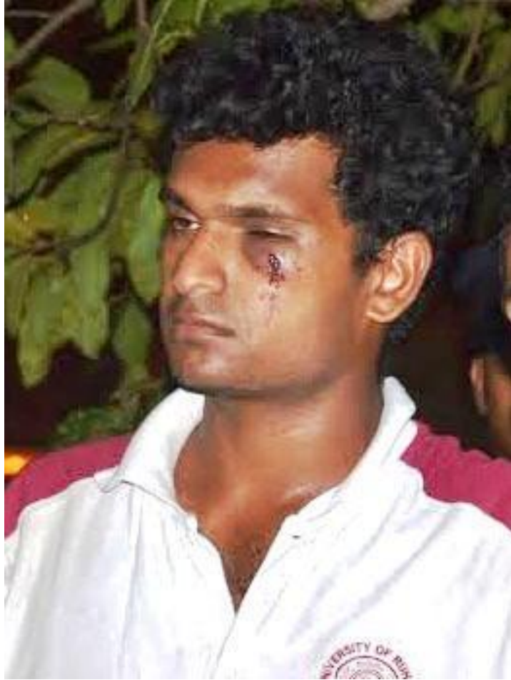
One of the tourtered students