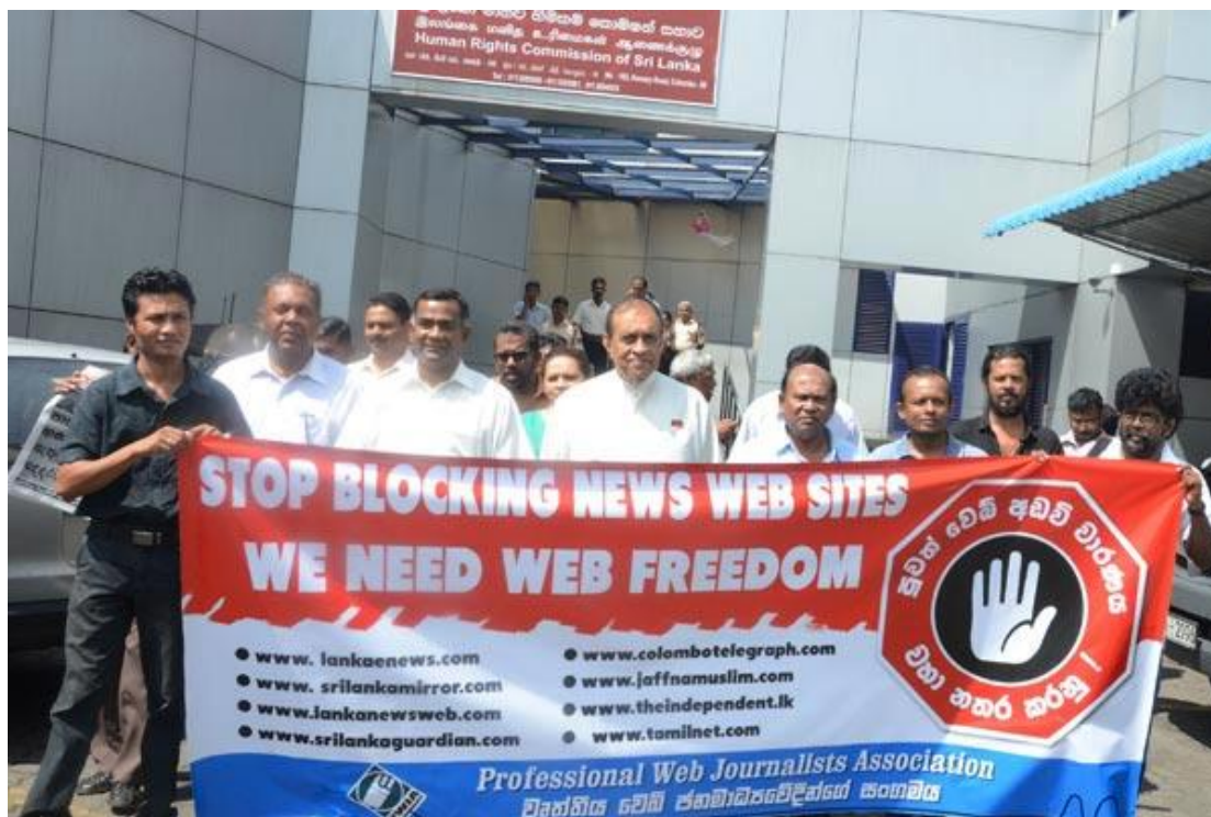
Journalists and opposition politicians posing for a photo after submitting the petition to NHRC-SL

A Commissioner for the HRCSL has told media that the Government blocking websites is unconstitutional 10 . But to the best knowledge of INFORM, until the above complaints had been filed, the HRCSL has not taken any definite and firm action in this regard ever since this practice has started several years ago, despite being vested with powers to initiate investigations on it's own, give formal determinations about the fundamental right(s) being violated, advising the government on unconstitutional requirements to registers websites etc.